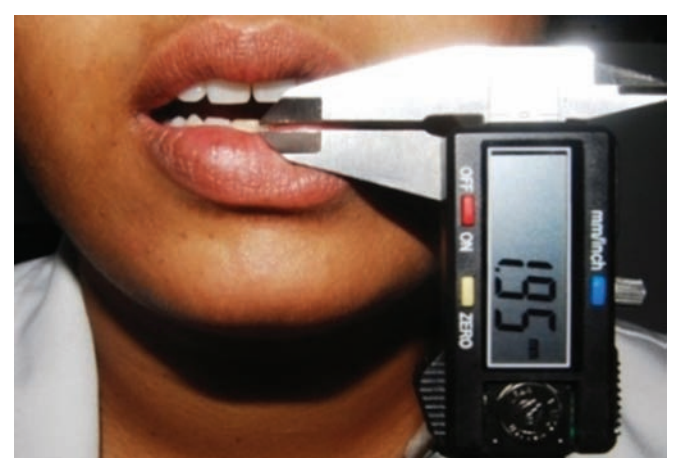
Fig. 2: Measurement of mandibular incisor visibility