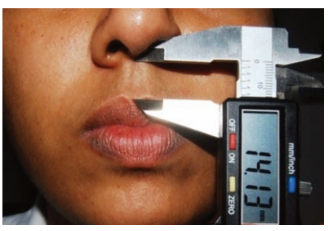
Fig. 3: Measurement of lip length